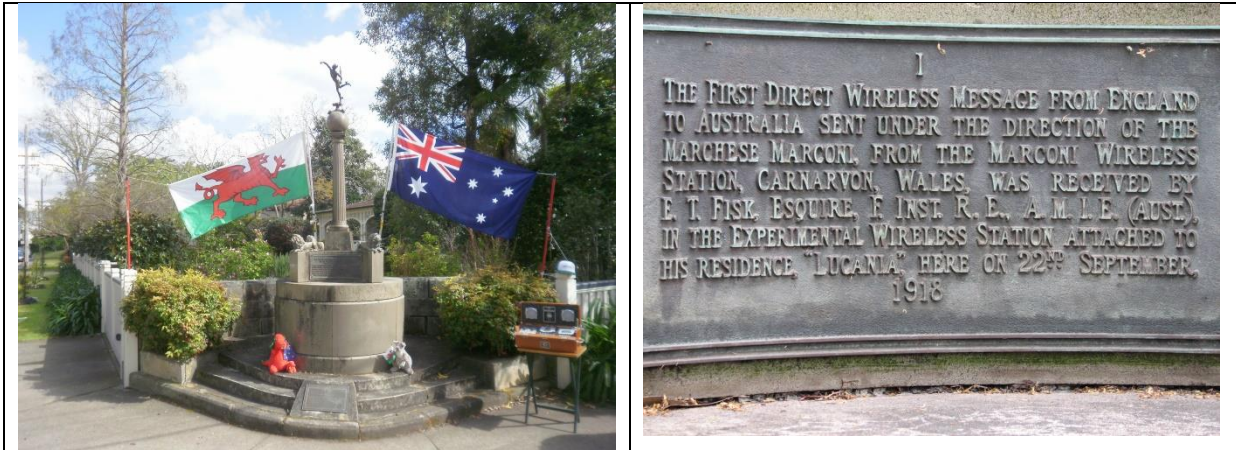
Monument erected in 1935 to mark the first long distance wireless transmission from Caernarfon (Carnarvon) to New South Wales. Pictures taken by Jo Harris on the occasion of the 75 th anniversary 25 years ago.

http://monumentaustralia.org.au/themes/technology/industry/display/23624-fisk-memorial